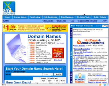
Place Recording Online