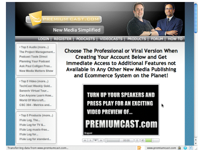
Update Podcast Feed